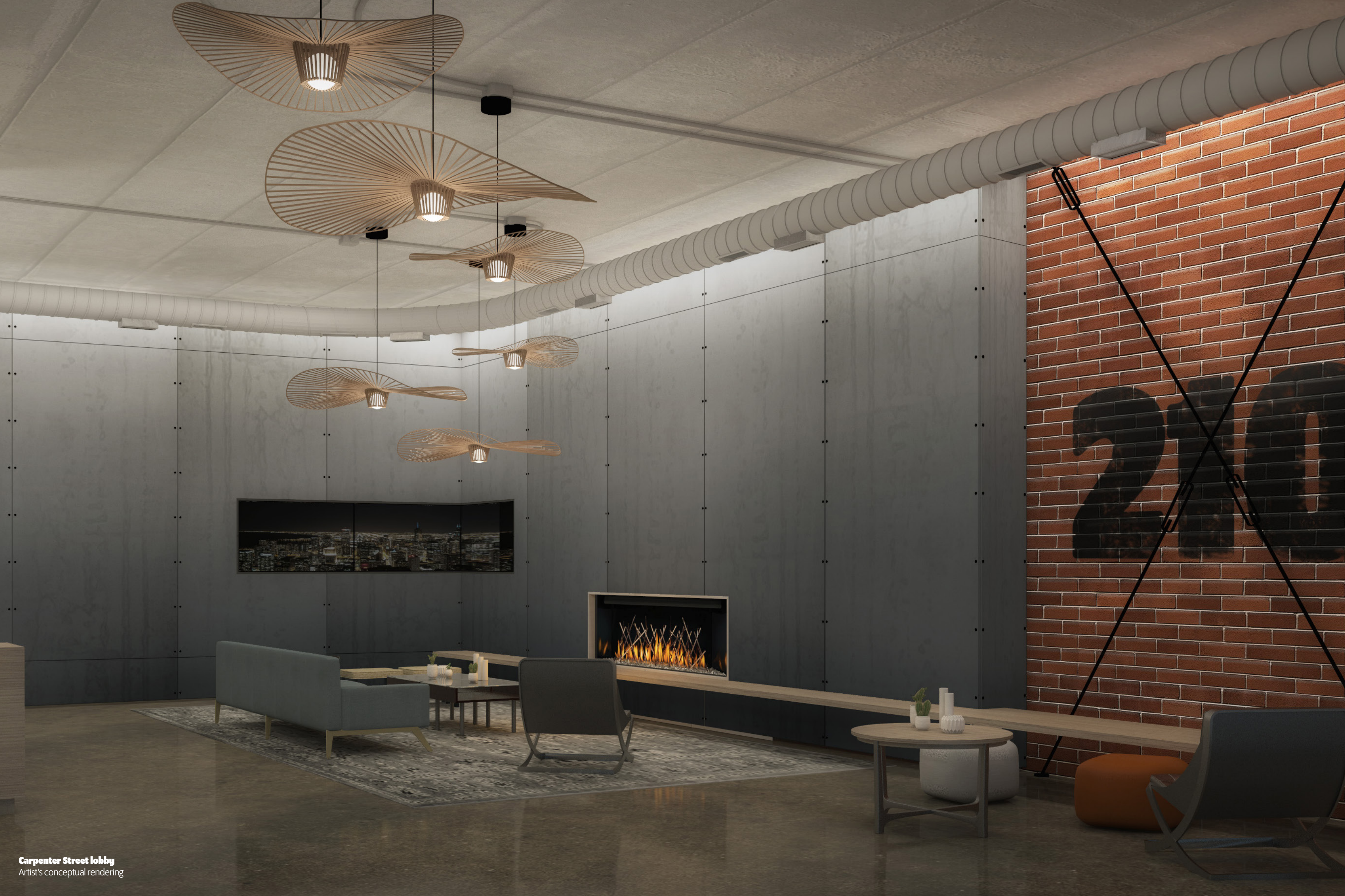
Carpenter Street lobby Artist's conceptual rendering